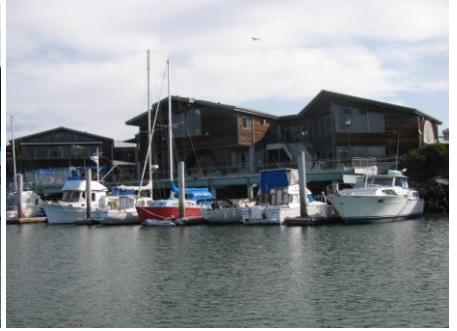
601 Embarcadero (L)