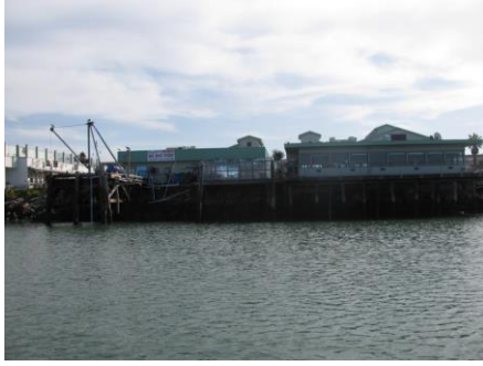
701 Embarcadero (S)