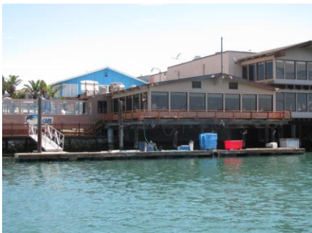
833 Embarcadero (S)