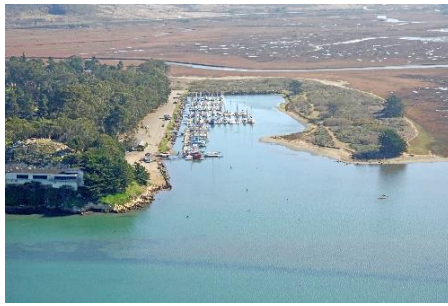
State Park Marina (L) 4