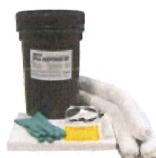
SKU: PK600S FiberDuck Oil Absorbent 6.5 gal Spill Kit