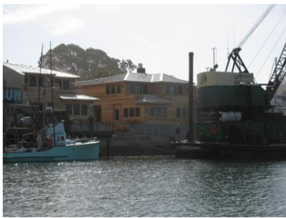
591-595 Embarcadero (S)