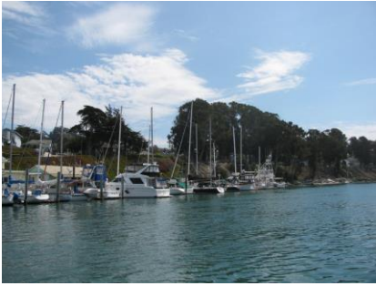
201 Main Street (L) 2