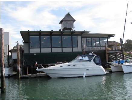
1205 Embarcadero (S)