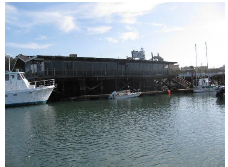
1185 Embarcadero (S)