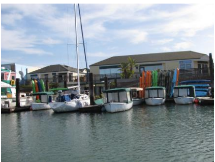
845 Embarcadero (L)