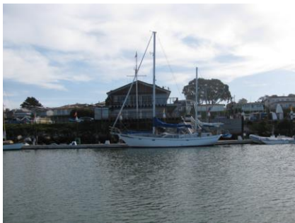
541 Embarcadero (L)