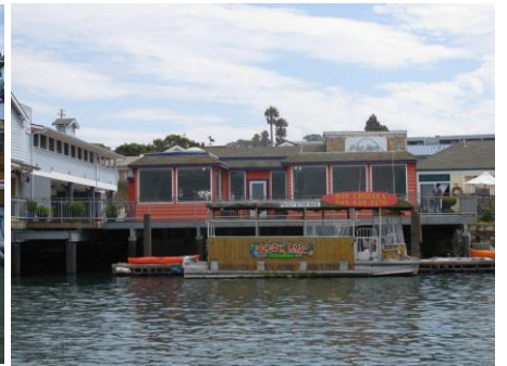
885 Embarcadero (S)