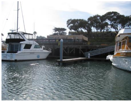
1001 Front Street (L)