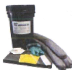
SKU: PK600U FiberLink Universal 6.5 gal Spill Kit

You may also be interested in the following product(s)