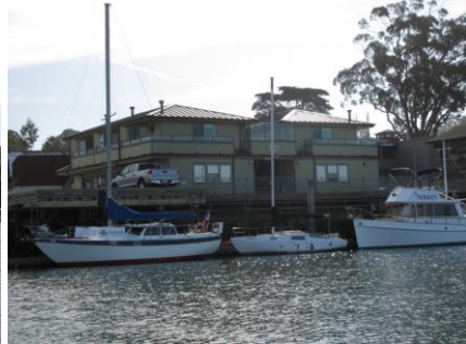
495 Embarcadero (S)