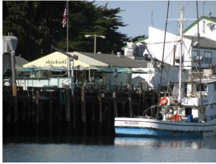
1245 Embarcadero (S)