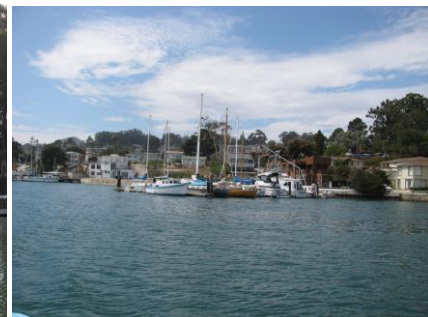
261 Main Street (L)