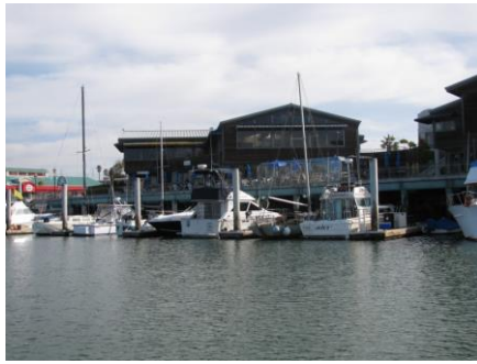
699 Embarcadero (L)