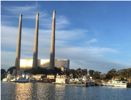
1213 -1217 Embarcadero (L) 2