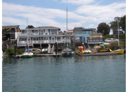
561 & 551 Embarcadero (S) 2