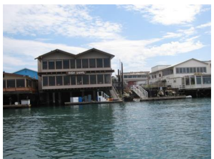
801 Embarcadero (S)