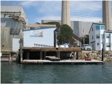
1287 Embarcadero (S)