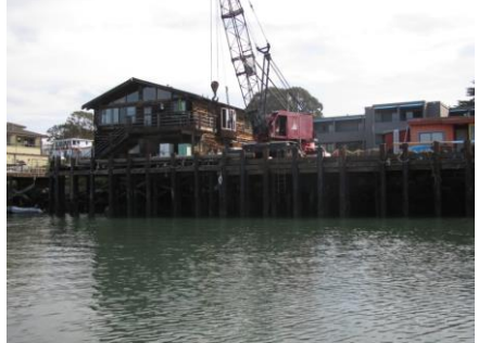
495 Embarcadero (L)