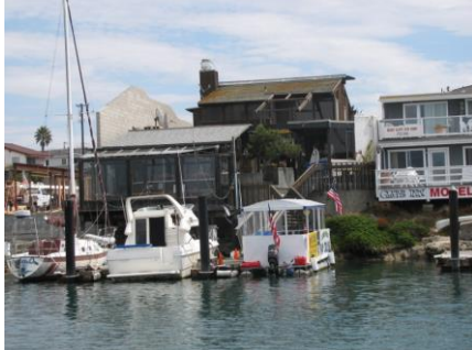
571 Embarcadero (S)