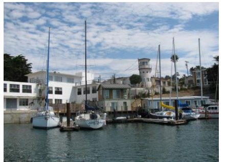
225 Main Street (L)