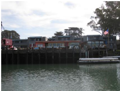
451 Embarcadero (S)