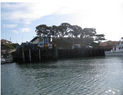
1099 Embarcadero- Fuel Dock (L)