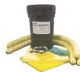
SKU: PK600H FiberLink Hazmat 6.5 gal Spill Kit